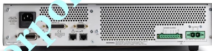
The Model 2651A supports GPIB, LXI, Digital I/O, and Keithley's TSP-Link for multi-channel synchronization.

Specifications are subject to change without notice. All Keithley trademarks and trade names are the property of Keithley Instruments, Inc. All other trademarks and trade names are the property of their respective companies.